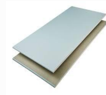
Plaster Board Paper 125-240 GSM