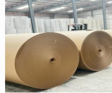
Simi-Chemical 125-240 GSM