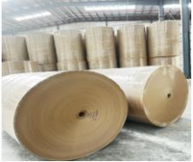
Flute Paper 90-240 GSM