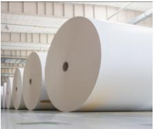
White Top Paper 125-240 GSM