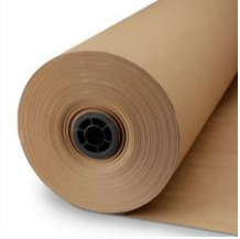
Test Liner Paper 90-240 GSM