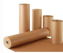
Kraft Paper 125-240 GSM